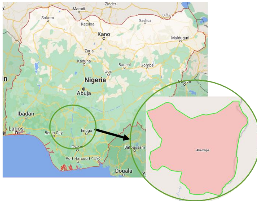
Figure 1. Location of the study area

The study was conducted in Akamkpa local government area of Cross River State, Nigeria. The local government area has a land mass of 4,300 square kilometres. In 2006, the population of Akamkpa LGA was 200,100 persons with a density of 40 persons per square kilometre [40]. Akamkpa local government area is made up of seven autonomous communities, two of which are at the Nigerian border with Cameroon. The seven autonomous communities in Akamkpa local government area are Akpai, Mfamosing, Ndapbachot, Achan, Abung, Owom, and Nyeji. The study was conducted in Achan and Abung, being the two communities closest to the border. In Achan, two border villages namely Old Ndebiji and Ekang were studied. In Abung, two villages were also selected as a result of their location at the Nigeria-Cameroon border. The villages are Abung and Ojok.